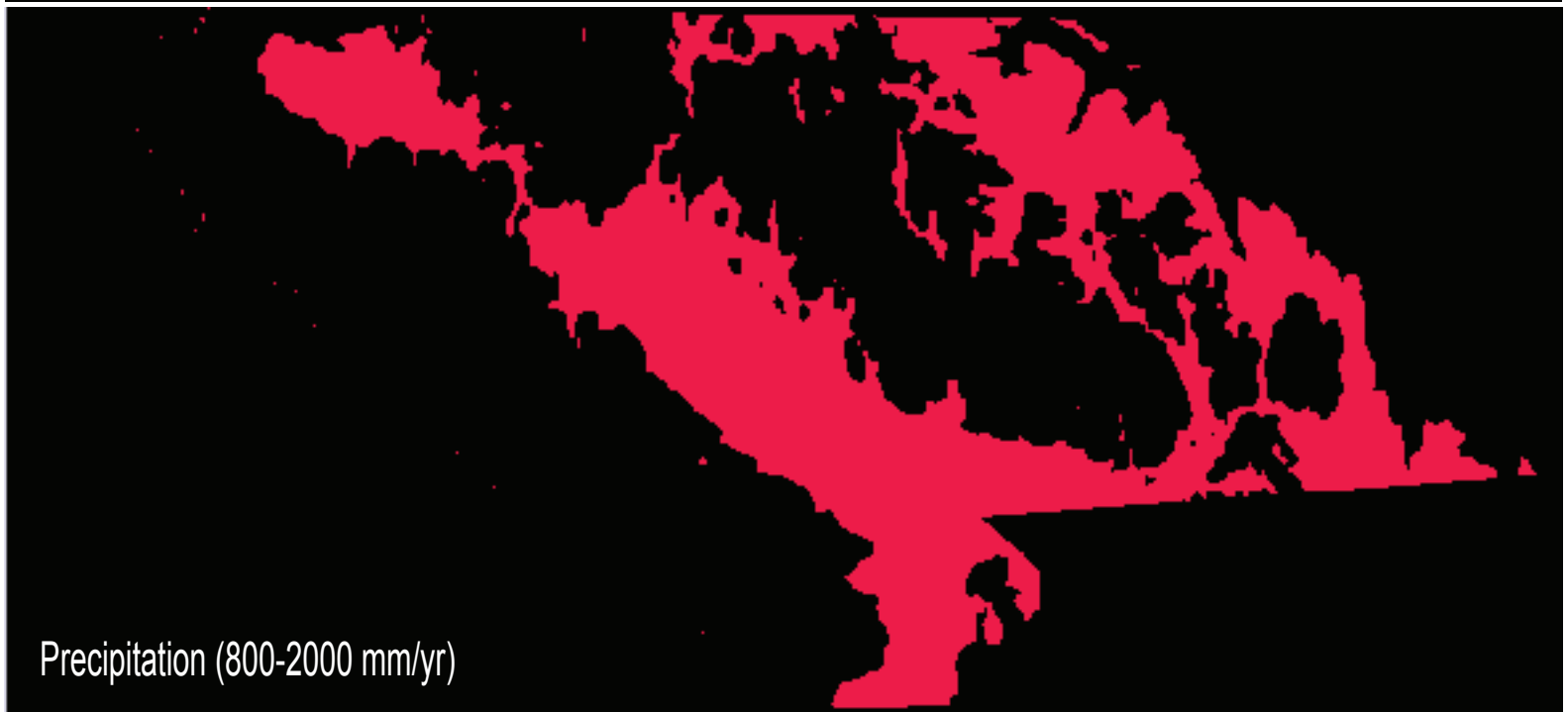
Precipitation (800-2000 mm/yr)